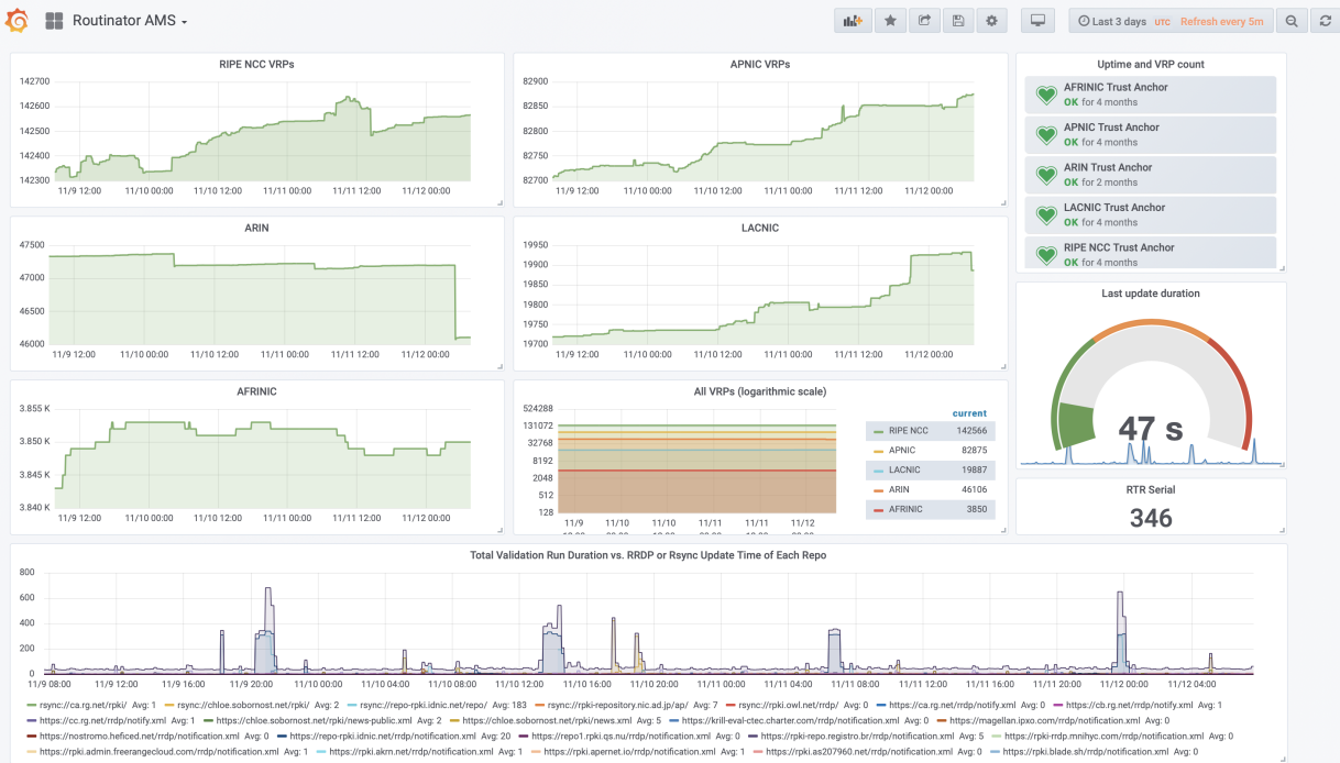
Fig. 2: Time series for each Trust Anchor